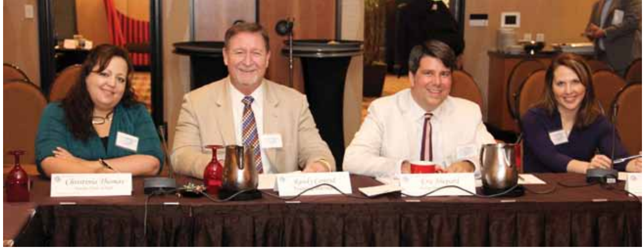
Employees of the NIGC prepare to deliver staff reports to the Commission during a public commission meeting.