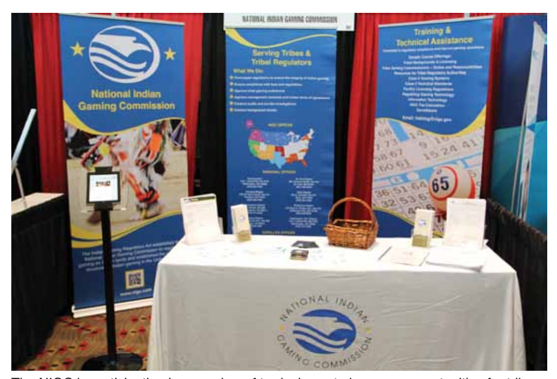
The NIGC is participating in a number of tradeshows to increase opportunities for tribes.