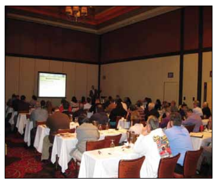
Sacramento Regional training event

To improve the training program's effectiveness and improve participants' response to trainings offered, the NIGC plans to update and revise course content so that it is immediately applicable and engaging for participants.